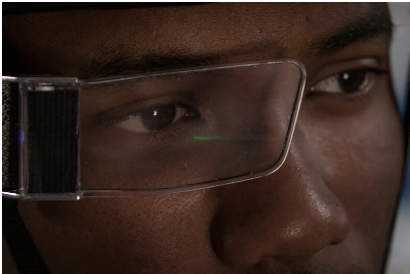
A U.S. soldier wearing a data display system, Camp Pendleton, California, March 2018