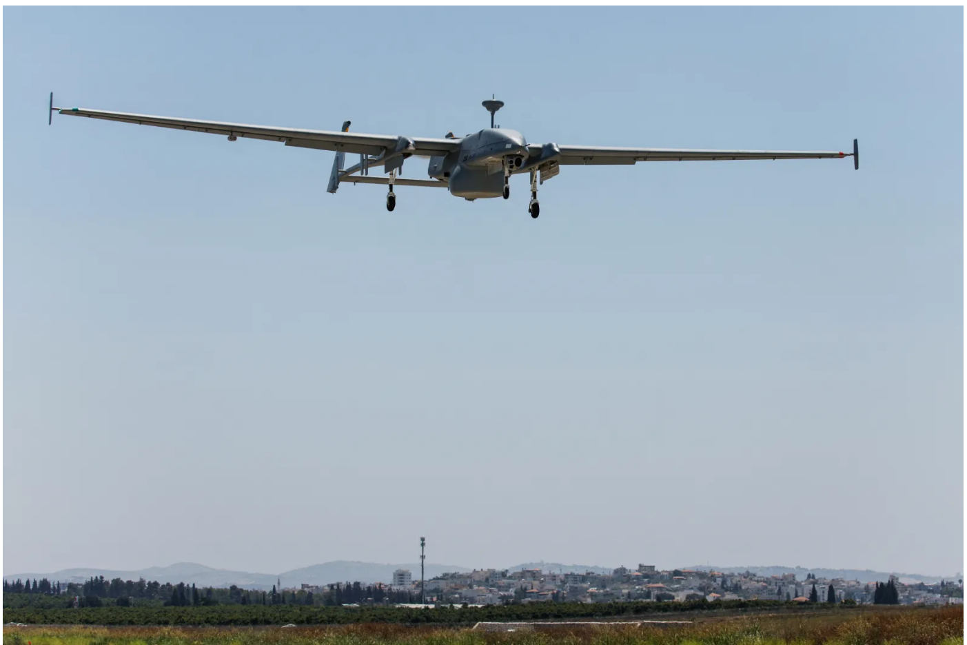
A drone flying above Ein Shemer, Israel, July 2023

principles governing how AI should be used. One principle called on the department's personnel to exercise judgment and care in developing, deploying, and using AI capabilities. Another said the Defense Department will try to "minimize unintended bias in AI capabilities." A third called for ensuring that all AI is made and used in ways that can be understood and explained—with data and methodologies that are transparent and auditable. And defense leaders have directed their employees to make sure that AI systems are rigorously tested for their safety, security, and effectiveness; that AI systems are assigned to clearly defined uses; and that AI systems can be disengaged or deactivated if they exhibit unintended behavior.